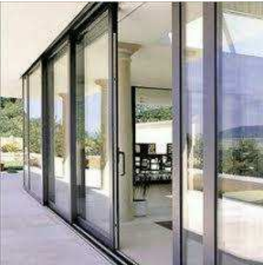
05: ALUMINIUM WINDOWS & DOORS