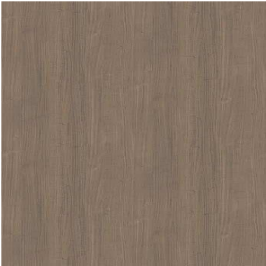
04: WOOD FINISH