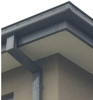
08: FASCIA & GUTTER