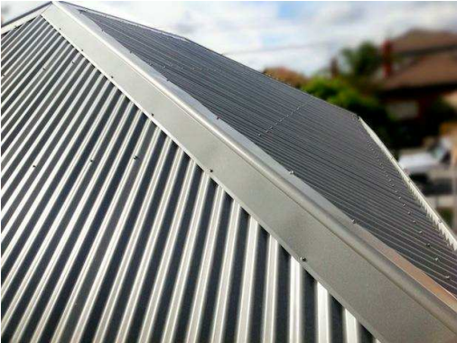
07: COLORBOND ROOF