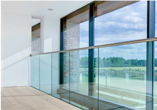
06: GLASS BALUSTRADE